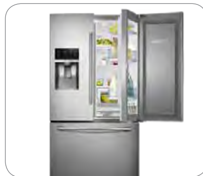
Food ShowCase Fridge Door