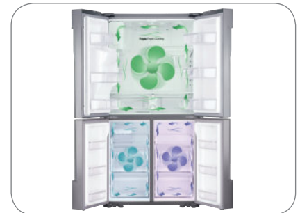
Triple Cooling System